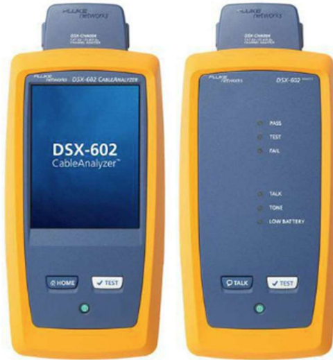
CAT6 Cable Analyzer DSX-602-PRO