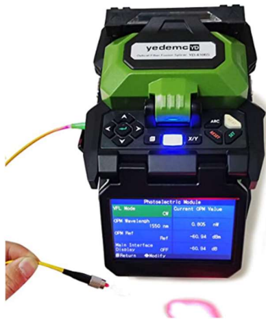
YEDEMC SM&MM Automatic Fiber Optical Fusion Splicer 4.3 Inch Touch Screen Display