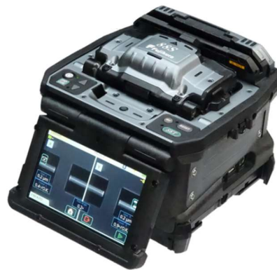
Fujikura 88S Splicing Machine